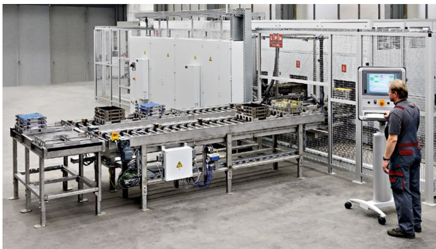
The new six-chamber machine is 13 metres wide and almost nine metres deep.