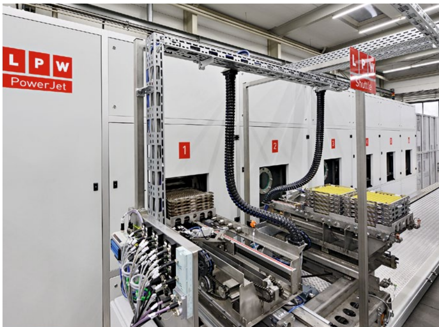
The shuttle allows the parts to be transported to and from the machine quickly and easily.

Using this modular single-chamber technology, multi-chamber machines have been produced for several years with a focus on improving throughput and flexibility. The decisive criteria in this respect are based